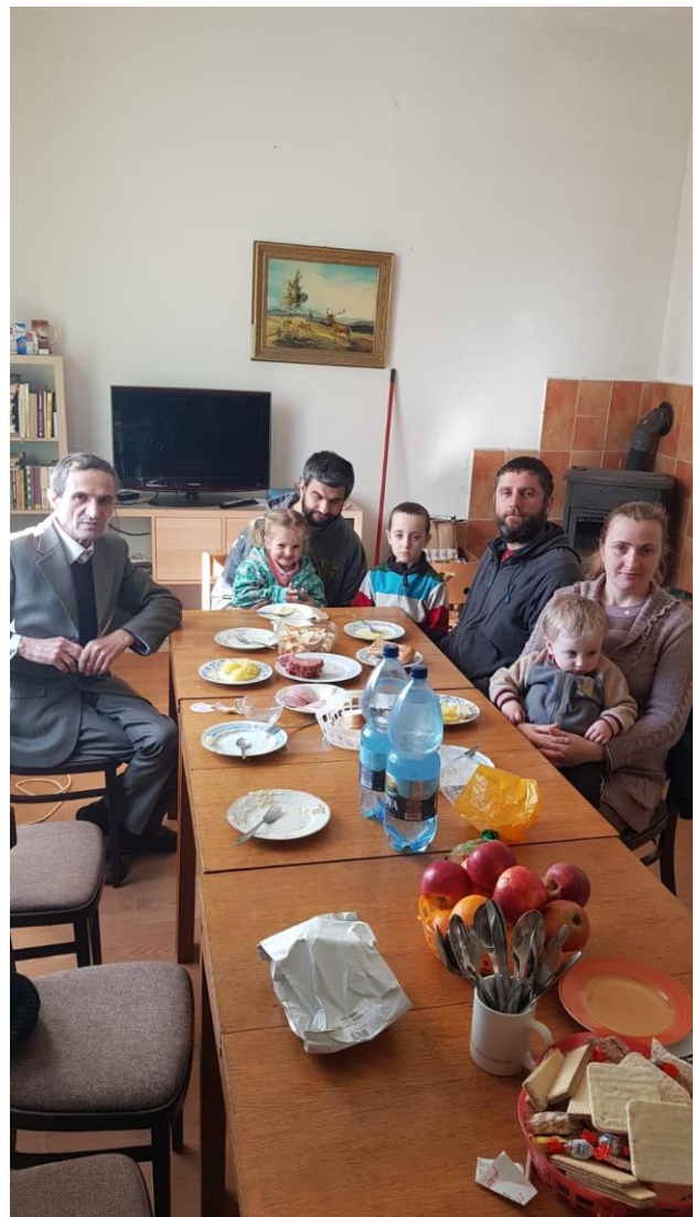
Veselka – safety after two thousand kilometers