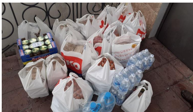
Humanitarian consignment to Ukraine